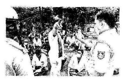
A farmer leader argues with a policeman at the protest in Belagavi

The farmers who gathered under the banner of Karnataka Rajya Raita Sangha and Hasiru Sene alleged that "the road that was passing through the agricultural lands have been now closed by the owners of those properties. The road was passing through lands (survey numbers 9, 100, 95,